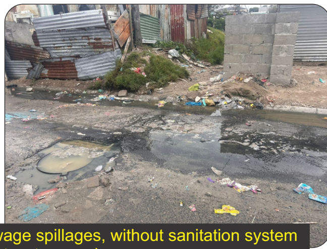
Majority of Africans live in squalor with sewage spillages, without sanitation system and safe, sufficient water supply.